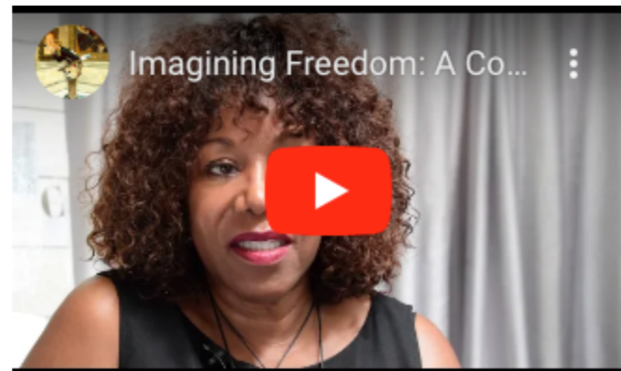
A Conversation with Ruby Bridges Hall Norman Rockwell Museum