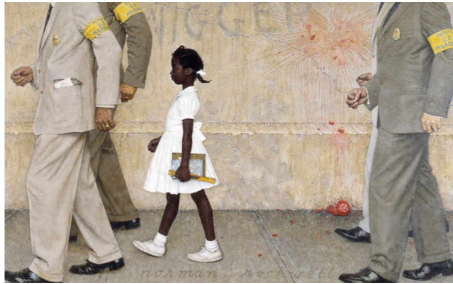
Norman Rockwell (1894-1978) The Problem We All Live With , 1963 Illustration for Look , January 14, 1964, pp. 22-23 Oil on canvas Norman Rockwell Museum Collection, NRM.1975.01