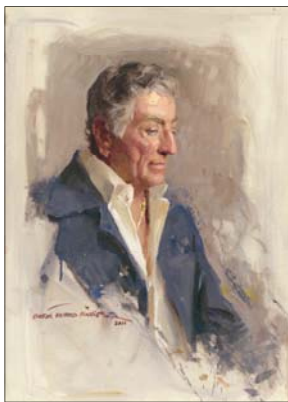
Portrait of Tony Bennett, by Everett Raymond Kinstler. 2006 Oil on canvas Collection of the artist