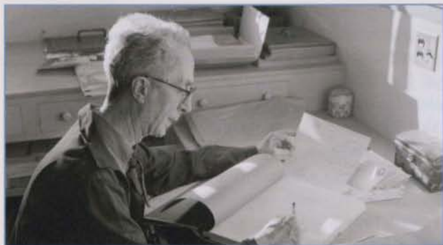
Norman Rockwell Answering Fan Correspondence, Stockbridge, Massachusetts ©1973.

Norman Rockwell My Adventures as an Illustrator , 1960