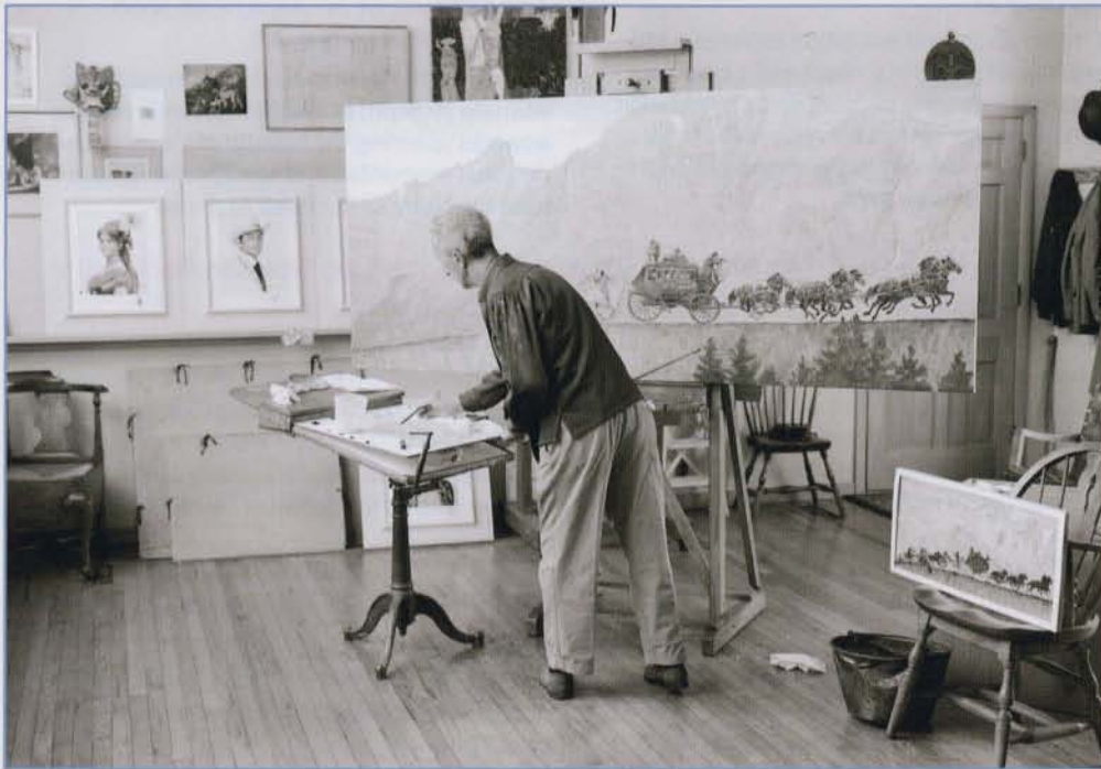
Norman Rockwell creating a painting for Stagecoach, 1965.