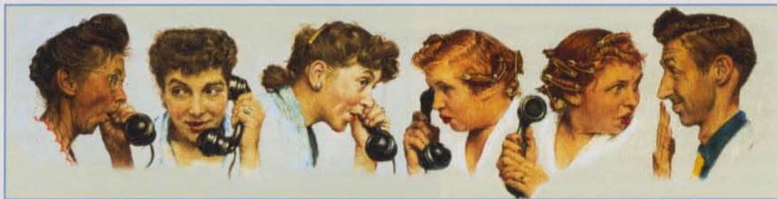
PHOTOGRAPH: Reference photos for Norman Rockwell's The Gossips, (detail), 1948. ILLUSTRATION: The Gossips (detail), Norman Rockwell.

drawing; the camera obscura, the camera lucida, mirrors, et cetera."