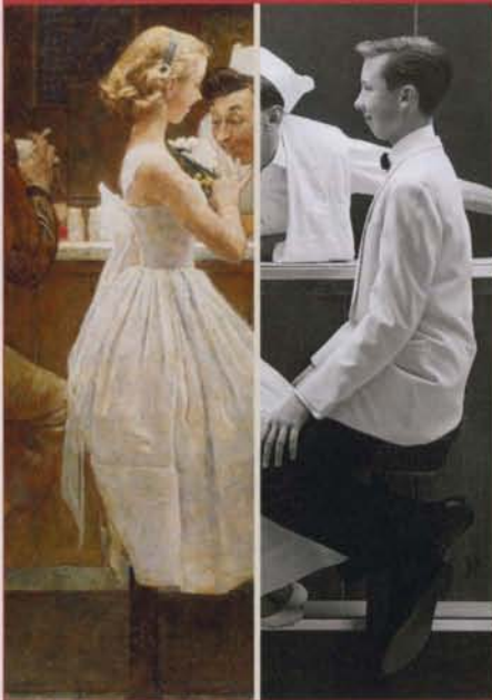
After the Prom (detail), Norman Rockwell. ©1957 SEPS. Licensed by Curtis Publishing, Indianapolis, IN. Licensed by Norman Rockwell Licensing, Niles, IL.

COVER PAGE ILLUSTRATIONS: Tattoo Artist , Norman Rockwell. ©1944 SEPS. Licensed by Curtis Publishing, Indianapolis, IN. The Runaway , Norman Rockwell. ©1958 SEPS. Licensed by Curtis Publishing, Indianapolis, IN.