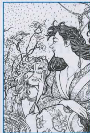
My Maiden Voyage . ©2002 Terry Moore. All rights reserved.