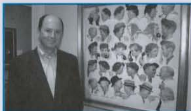
Graphic novelist Terry Moore, creator of Strangers in Paradise , stands next to one of his favorite Norman Rockwell paintings, The Gossips , at the exhibition opening.