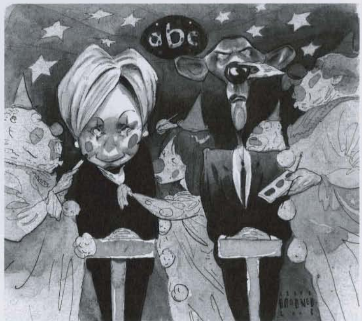
Debate Night , ©2008 Steve Brodner. All rights reserved.

The exhibition examines the artist's creative and technical process and includes a fascinating comparison with portraits of political candidates created by Norman Rockwell during a very different era in U.S. political history. In the finest