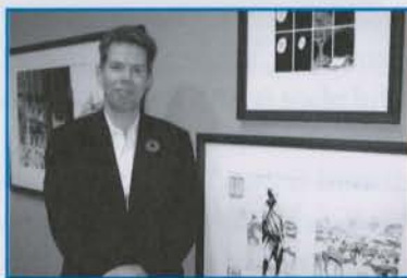
Cerebus creator Dave Sim poses next to his artwork at the exhibition opening.

The exhibit is a must, not only for comic fans, but for anyone who celebrates illustration, graphic commentary, personal storytelling, humor, fine art, or the constant evolution of expression.