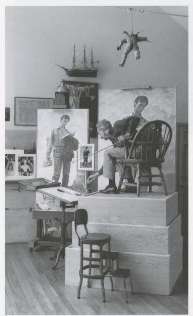
Norman Rockwell painting Lincoln the Railsplitter, 1965

"I hope this painting might inspire the youth of this land to appreciate this man who believed so much in the value of education."