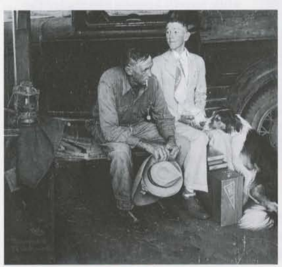
Breaking Home Ties