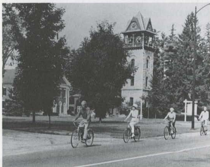
Norman Rockwell bicycling with friends in Stockbridge, circa 1964.

Starting in June and continuing through October, we will revisit Rockwell's bike routes. Experienced museum guides will lead the trips and provide commentary on historical and cultural aspects of the routes, and insights into Rockwell's character and his special recreational avocation. See our calendar for details. Further information on specific tours is available by calling (413) 298-4065.