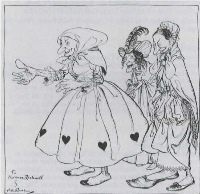
The Three Spinners by Arthur Rackham are just a few of the intriguing characters found in Off His Walls .

A special exhibition of illustration art from the personal collection of Norman Rockwell. The pieces in the show were part of a study collection from which Rockwell drew both inspiration and great enjoyment. Included are works by Charles Edmund Brock, Thomas Fogarty, A.B. Frost, John Held, Jr., J.C. Leyendecker, Maxfield Parrish, Edward Penfield, Howard Pyle, Arthur Rackham, and Hugh Thomson.