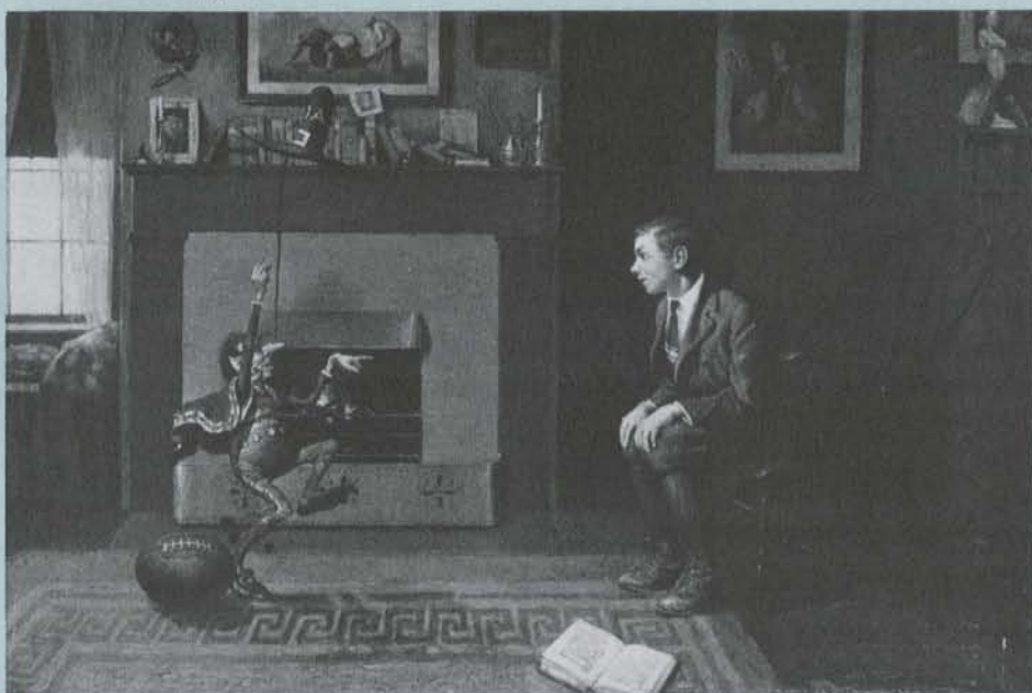
The fairy tells time by the number of spins of his hat in The Magic Foot-Ball, currently on view in Off His Walls.

Norman Rockwell's painting for The Magic Foot-Ball , a children's story by Ralph Henry Barbour, appeared in St. Nicholas magazine in 1914. This is a fanciful story in which dream becomes reality and the limits of our imagination are stretched.