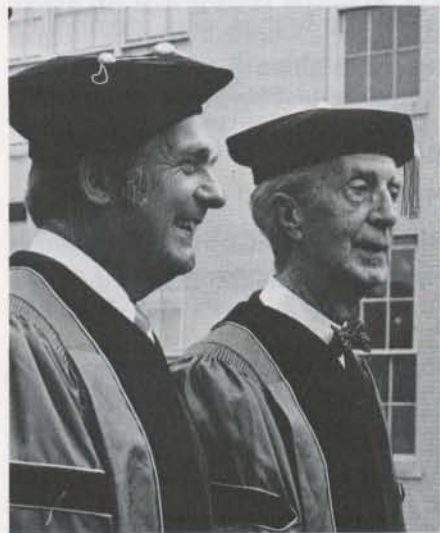
Silvio Conte with Norman Rockwell in 1972