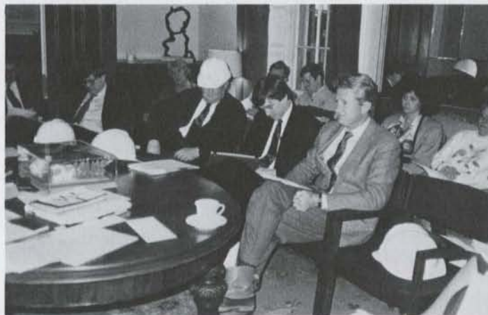
Museum board and staff members at the February 2 meeting.

Many festivities are being planned to celebrate construction. The first event is groundbreaking on April 13, at 11 A.M., at our Linwood site. See the calendar for other important dates.