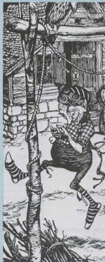
Detail of Arthur Rackham fairy

The myth of a strange creature, at once frightening and intriguing, who has magical powers to fulfill wishes, is restated through Rockwell's picture for another generation of children as a tradition to be carried on and on.