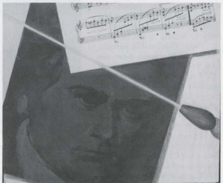
Beethoven by Jeff Kesses (1986), oil on masonite