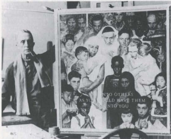
Norman Rockwell with his painting, The Golden Rule , which is on view in One Nation Indivisible? Images of Black Americans: 1934-1967 by Norman Rockwell through January 1990. The Golden Rule © Copyright 1961, Curtis Publishing Company.