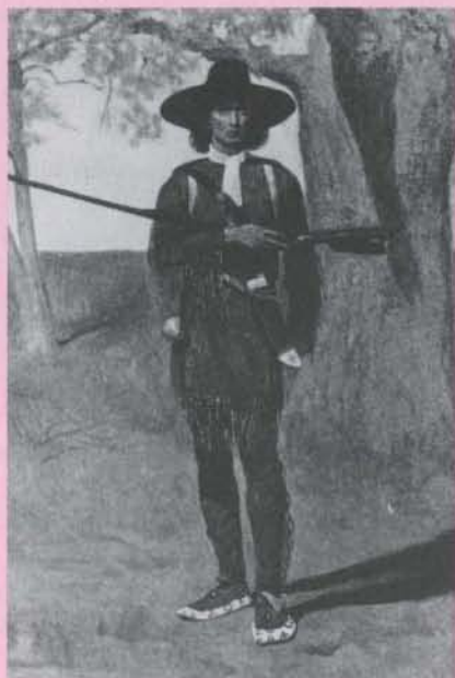
Daniel Boone, Pioneer Scout is the latest addition to the Museum's permanent collection.

Norman Rockwell's 64-year association with the Boy Scouts of America resulted in some of his best-known illustrations — those of young Scouts in action, done for the Boy Scouts' calendar. One of these illustrations (produced for the 1941 calendar) was featured in this column in the spring 1989 issue of Portfolio . Rockwell's work for the Boy Scouts, however, also includes a large number of story illustrations for Boys' Life magazine.