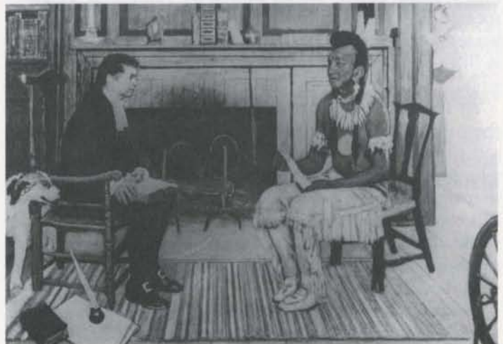
John Sergeant and Chief Konkapot by Norman Rockwell.