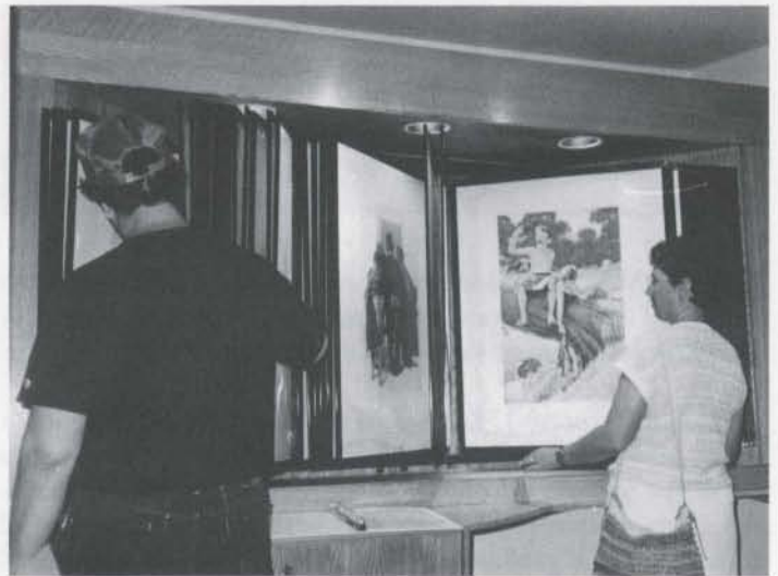
Customers browse in our new limited-edition print area in the Museum shop

Adopted by the board of trustees on September 23, 1985. Revision adopted June 5, 1989.