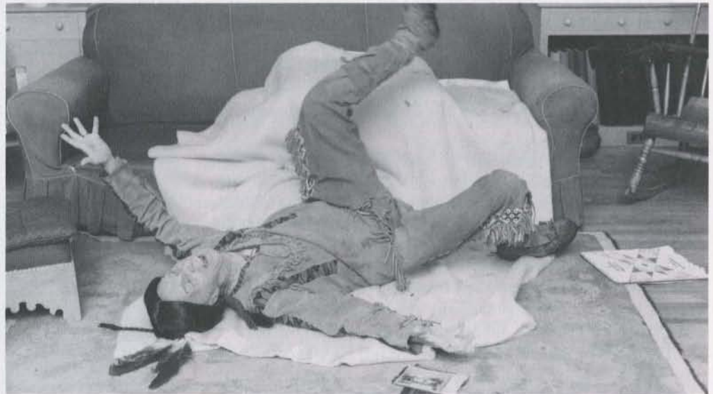
Working studio photograph of Norman Rockwell posing for the movie poster he created for the film Stagecoach (20th Century Fox, 1966). An exhibition of this and other preparatory photographs used by Rockwell will be on view at The Old Corner House from September 14 through November 7.