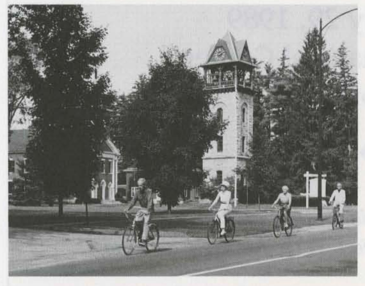
Norman Rockwell pedals down the streets of Stockbridge, circa 1964.

Members' Opening Reception From Settlement to Main Street USA: Stockbridge 1739-1989. The Old Corner House, 5:30 - 7 P.M.