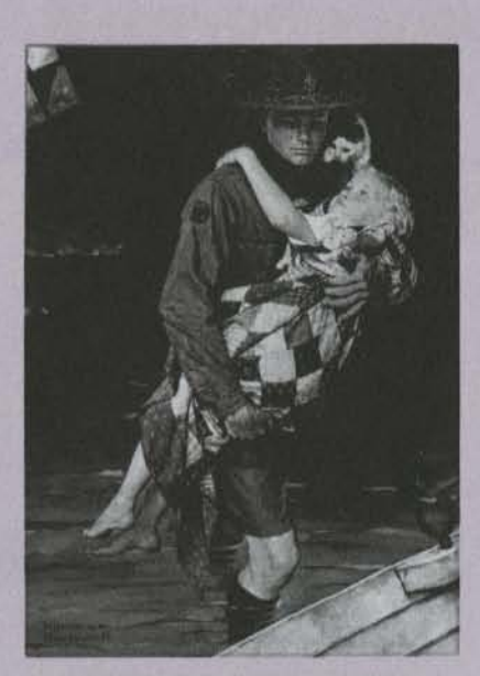
A Scout is Helpful by Norman Rockwell.

This painting is an important addition to our collections, because