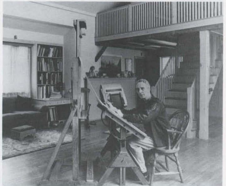
Norman Rockwell in his studio

It is anticipated that the studio will open to the public in 1991.