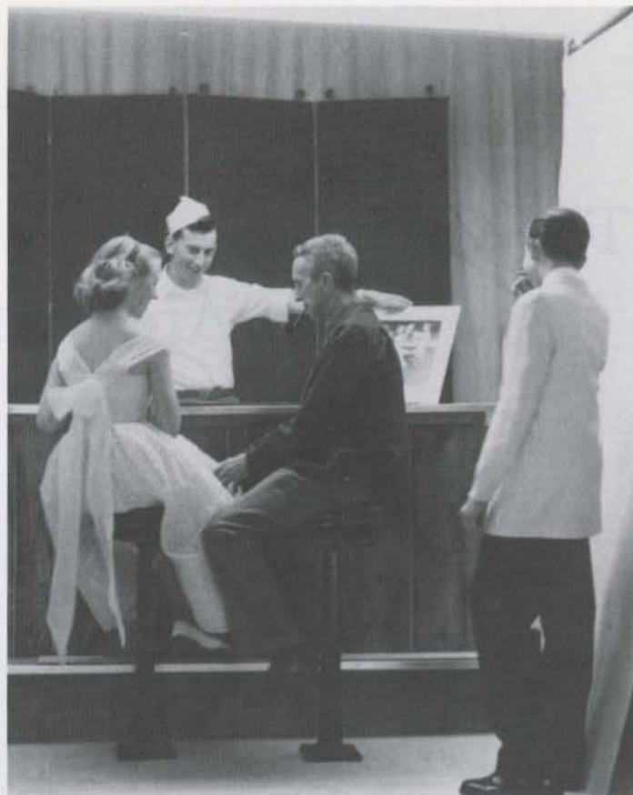
Rockwell sets the scene for After the Prom

The Museum ended the year 1987 with 123,000 visitors to The Old Corner House, the biggest year ever. What great changes have taken place in many areas since the opening of the Museum in 1968, when there were fewer than 5,000 visitors for the entire year! Predictions are that 1988 will be another banner year. The Department of Tourism in Boston anticipates that tourism will be up for the entire Berkshire area. The department has been offering special publicity about the Berkshires. Undoubtedly, Tanglewood will attract more than the usual number of visitors this summer, as it celebrates Leonard Bernstein's 70th birthday as well as the 50th anniversary of the founding of the Tanglewood School of Music. Another popular area of attraction, The Berkshire Theatre Festival, is observing its 60th anniversary this year. These hallmark events and seasons should increase visitorship to the Museum during the already busy summer season. We're looking forward to another record year.