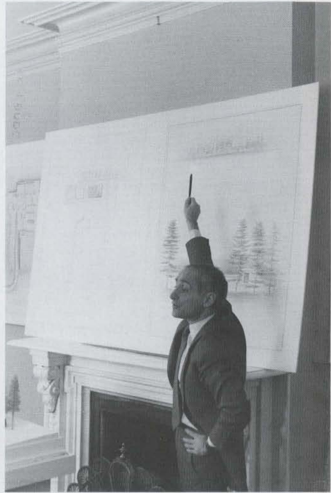
Robert A. M. Stern presents his design