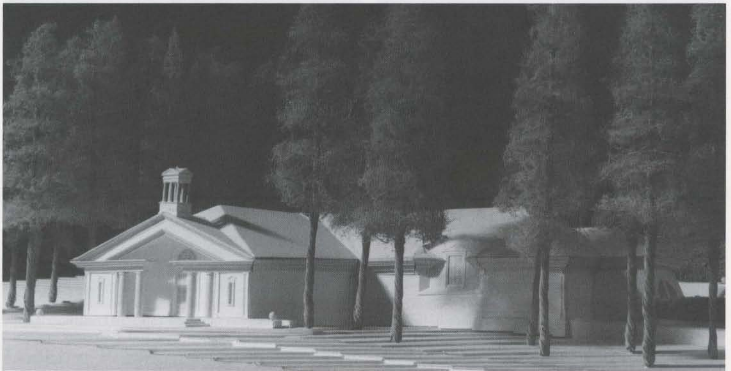
A model of Robert A. M. Stern's design for the new gallery building