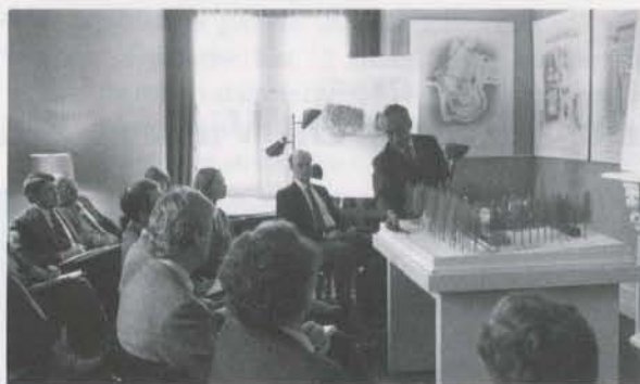
Robert A. M. Stern discusses his design before members of the staff and board of trustees