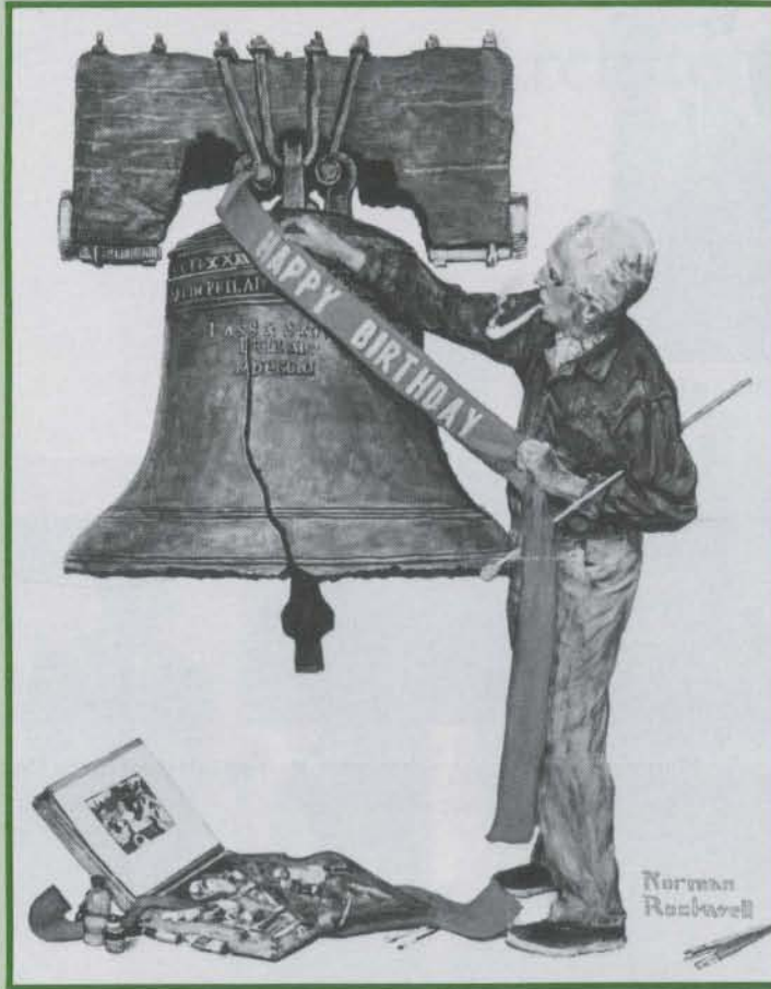
Liberty Bell (Celebration) by Norman Rockwell. Oil on canvas, 45 x 33 inches, 1976, American Artist : July 1976 cover.

This country's bicentennial was celebrated in a variety of ways in 1976, all distinctly American. American Artist magazine chose Norman Rockwell, the quintessential American artist, to paint the cover illustration for its July 1976 issue, Celebration . In an accompanying article, Editor Susan E. Meyer wrote, "And so it seemed fitting that America's favorite art magazine should commission America's favorite painter to celebrate the occasion of the nation's 200th birthday."